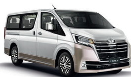
Luxury Pearl Toning